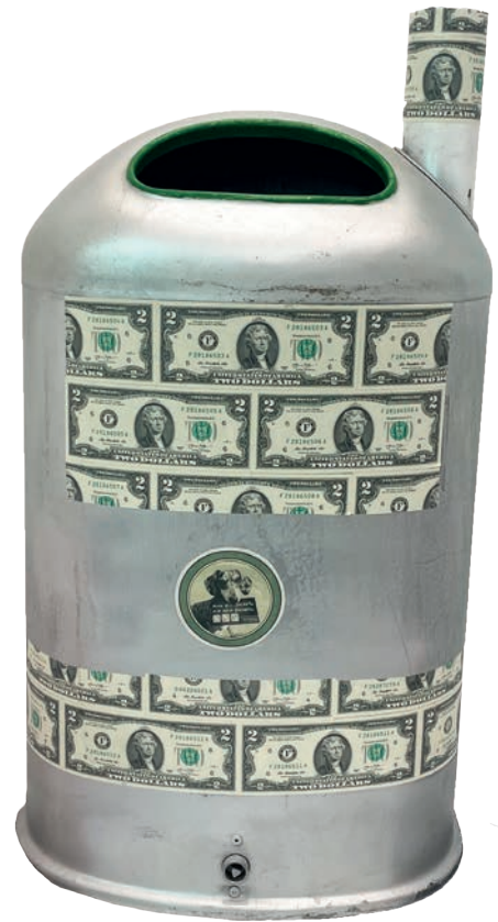
Vienna Cash Trash 2 Dollars on Viennas trash can High 75 cm, 2024 € 2.800