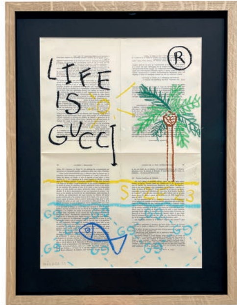
Life is Gucci Oil chalk on spanish book pages 46 x 63,5 cm Málaga, 2023 € 12.000