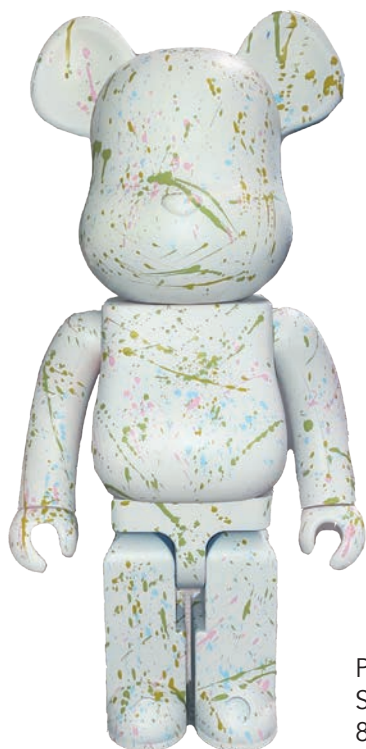
Pure Bear Spray on Bearbrick 85 cm high, 2024 € 1.600