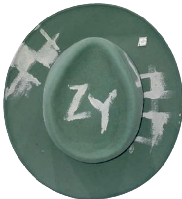
Game Hat x ZY 2024 € 1.200