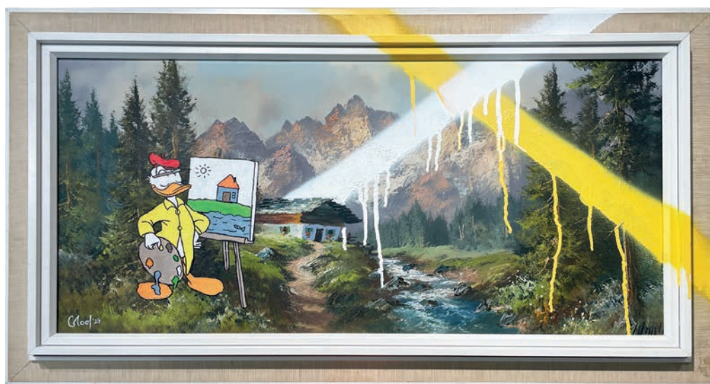
Artist Life Oil, acrylic and spry on canvas 97 x 55 cm, 2024 € 9.000