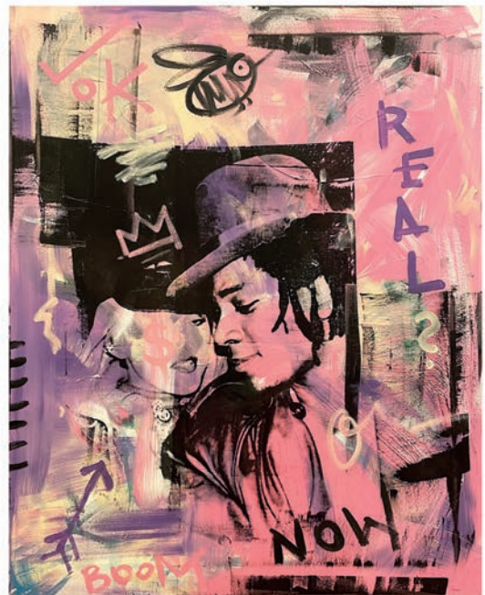
Art (ist) Love Mixed Media on canvas 80 x 100 cm, 2023 € 4.500