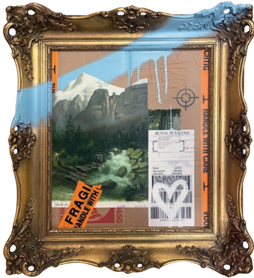
Keiner kennt sich aus Mixed Media on shipping box incl. canvas 48 x 54 cm, 2024 € 3.500