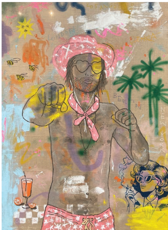
Self Portrait No1 Acrylic, spray and oilstick on jute fabric 175 x 240 cm, 2024 On Request