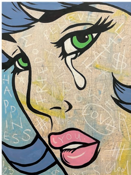
You Acryl and oilstick on canvas incl. newspaper 60 x 80 cm, 2023 € 2.600