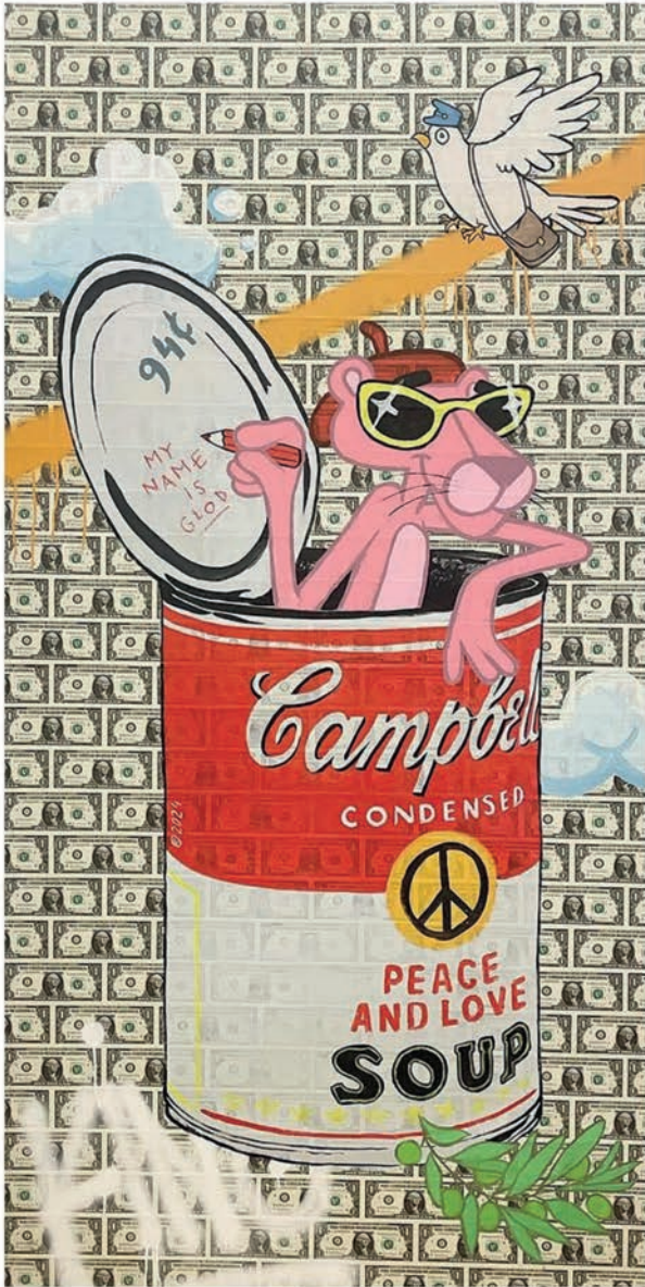
Soup Acrylic and spray on canvas incl. 1$ Dollars 200 x 100 cm, 2024 € 23.000