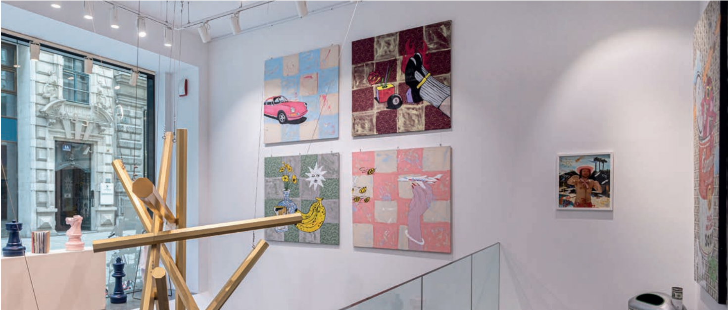
Acrylic on canvas 120 x 120 cm, 2024 € 4.500 (each)