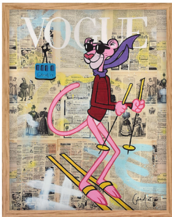
Panther Ski Fine art print on premium paper 40 x 50 cm, 2025 Edition of 50 (signed and numbered by Glod) € 250