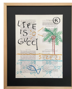
Life Is Gucci Fine art print on premium citrus paper 53 x 43 cm (Framed), 2024 Edition of 50 (signed and numbered by Glod) € 370