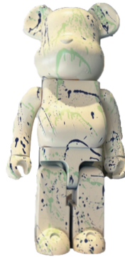
Gastein Bear Lack on sculpture High 75 cm, 2025 Unqiue Artwork (1/1) € 1.650