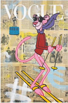
Alpine Downhill Fine art print on canvas 120 x 80 cm, 2025 Edition of 50 (signed and numbered by Glod) € 1.090