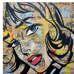
Roys Lady Fine art print on canvas 70 x 70 cm, 2025 € 490