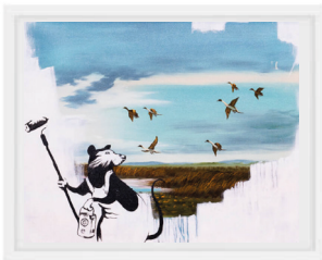
Freedom Fine art print on canvas 45 x 65 cm (Framed), 2025 Edition of 50 (signed and numbered by Glod) € 390