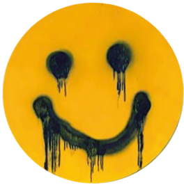
Always :) Spray and acrylic on canvas Installation / Back is a smiley 70 x 70 cm, 2025 Unqiue Artwork (1/1) € 1.500