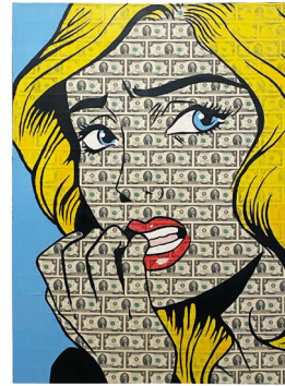
In Love Fine art print on canvas 120 x 90 cm, 2025 Edition of 50 (signed and numbered by Glod) € 850