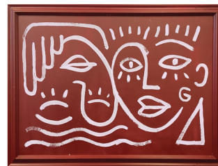
Face - Love Acrylic and lack on carton 77 x 58 cm (Framed), 2024 Unqiue Artwork (1/1) € 3.700