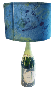
PL Lamp Blue Spray and acrylic on bottle 45 x 30 cm, 2025 Unqiue Artwork (1/1) € 550