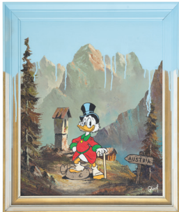
On The Top Fine art print on paper 56 x 46 cm, 2025 Edition of 15 (signed and numbered by Glod) € 450