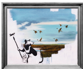
Freedom Fine art print on premium paper 36 x 46 cm (Framed), 2024 Edition of 15 (signed and numbered by Glod) € 350