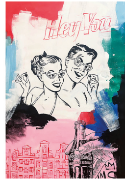
Nightlife Fine art print on canvas 120 x 80 cm, 2025 Edition of 50 (signed and numbered by Glod) € 780