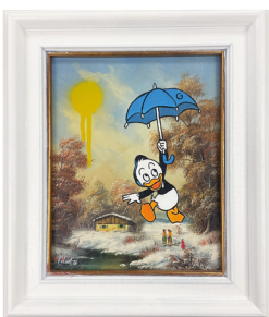
Just Fly Oil, spray and acrylic on canvas 32 x 23 cm (Framed), 2022 Unqiue Artwork (1/1) € 1.250