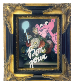
Bonjour Panther Oil, spray and acrylic on canvas 43 x 33 cm (Framed), 2025 Unqiue Artwork (1/1) € 1.800