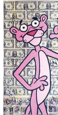
Servus (Black) Acrylic and spray on canvas incl. dollars 80 x 40 cm, 2024 Unqiue Artwork (1/1) € 2.900