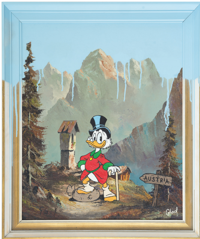
On The Top Oil, acrylic and spray on canvas 69 x 59 cm, 2025