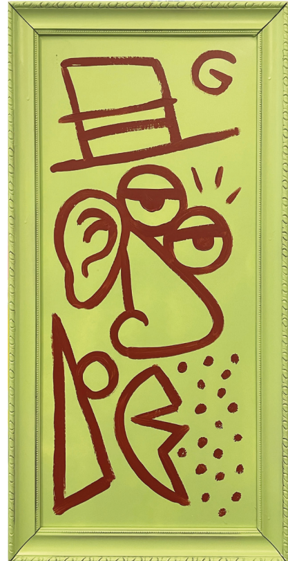
Gentleman Acrylic and lack on carton 86 x 44 cm, 2024 € 3.500