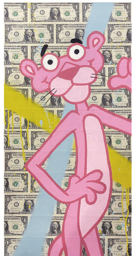
Servus Acrylic and spray on canvas incl. dollars 80 x 40 cm, 2024