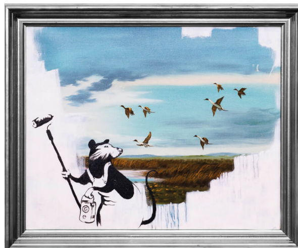
Freedom Print on canvas 36 x 46 cm (Framed), 2024 Edition of 15 € 350