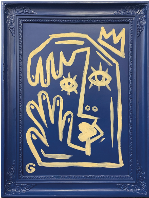
Reflection Acrylic and lack on carton 82 x 62 cm, 2024 € 4.500