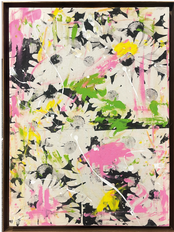
Blossom Acrylic and silkprint on canvas 74 x 54 cm (Framed), 2024 € 1.700