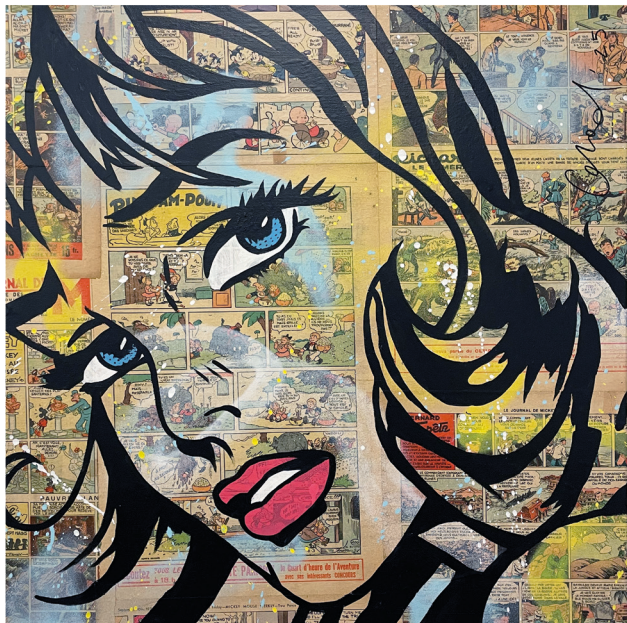
Roys Lady Acrylic and spray on canvas incl. french comic (Paris 1983) 60 x 60 cm, 2025