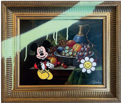
Happy Flower Oil, acrylic and spray on canvas 39,5 x 33,5 cm, 2023 € 1.900