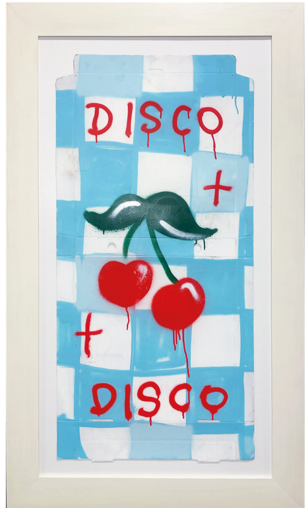
Disco Disco Spray on pizza box 120 x 60 cm, 2024 € 5.000