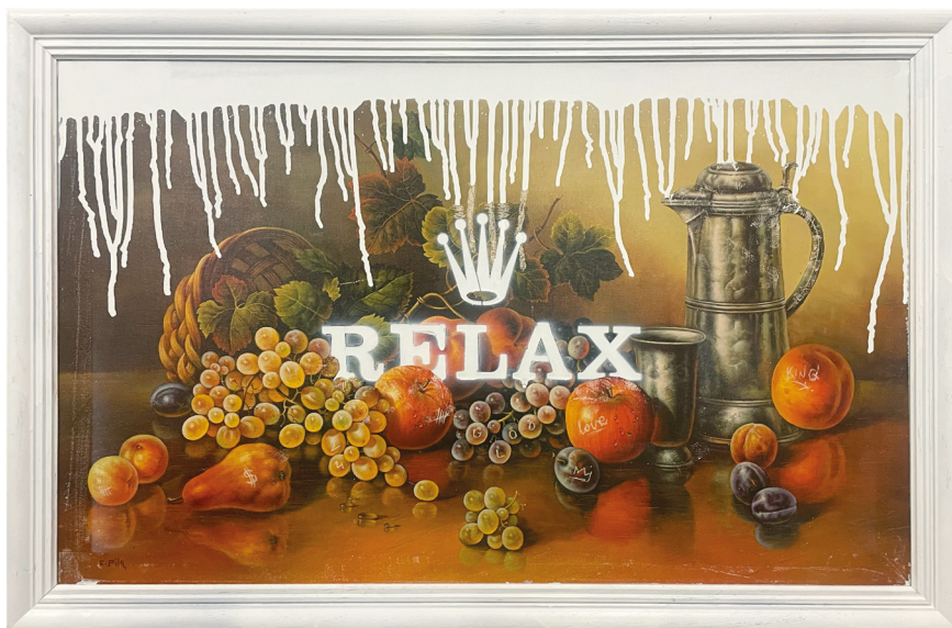
Relax (Snow) Lack on plate 55 x 85 cm, 2024 € 3.900