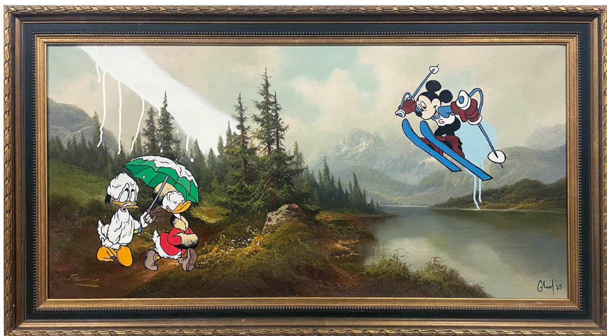
Winter Is Coming Oil, acrylic and spray on canvas 97 x 55 cm, 2024 9.500 Euro