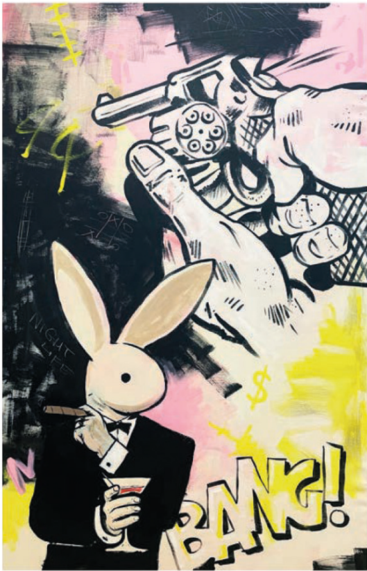
Nightlife Print on canvas 120 x 80 cm, 2025 Edition of 50 € 890